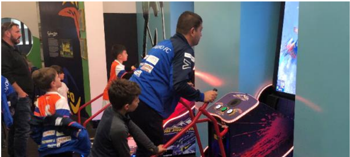
AIS: Fun for kids of all ages...