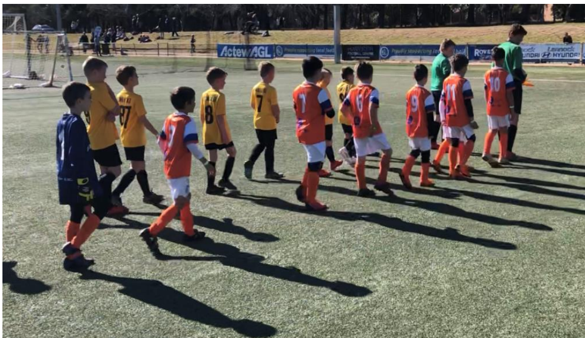
Lugarno and Gungahlin teams walk onto the park for their all-important round 3 fixture