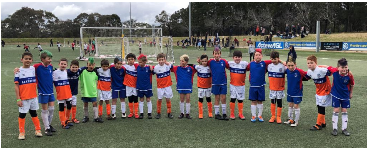
Match played in great spirits – Lugarno FC and Majura FC post game