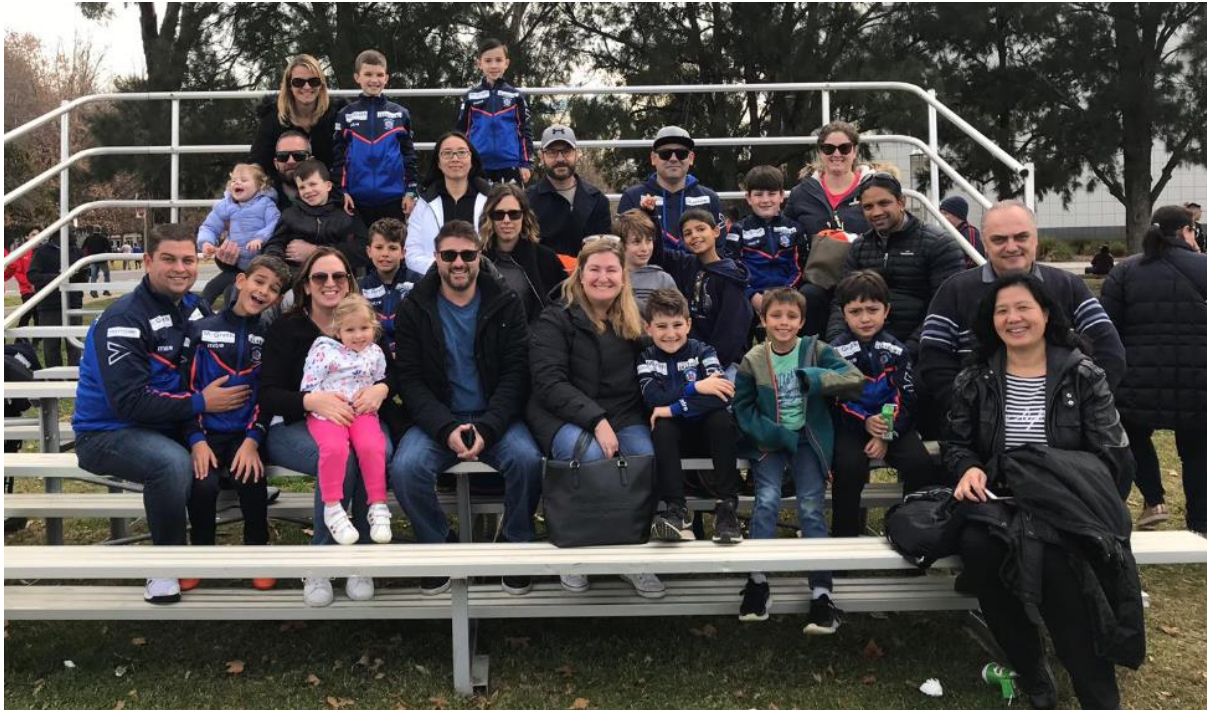
Lugarno U9 family members after the opening ceremony

The boys did a few laps with coach and manager in tow. Excitement was in the air as the team got a great cheer from the Lugarno parents in the corner of the grounds. This was a journey that all the families were taking as one.