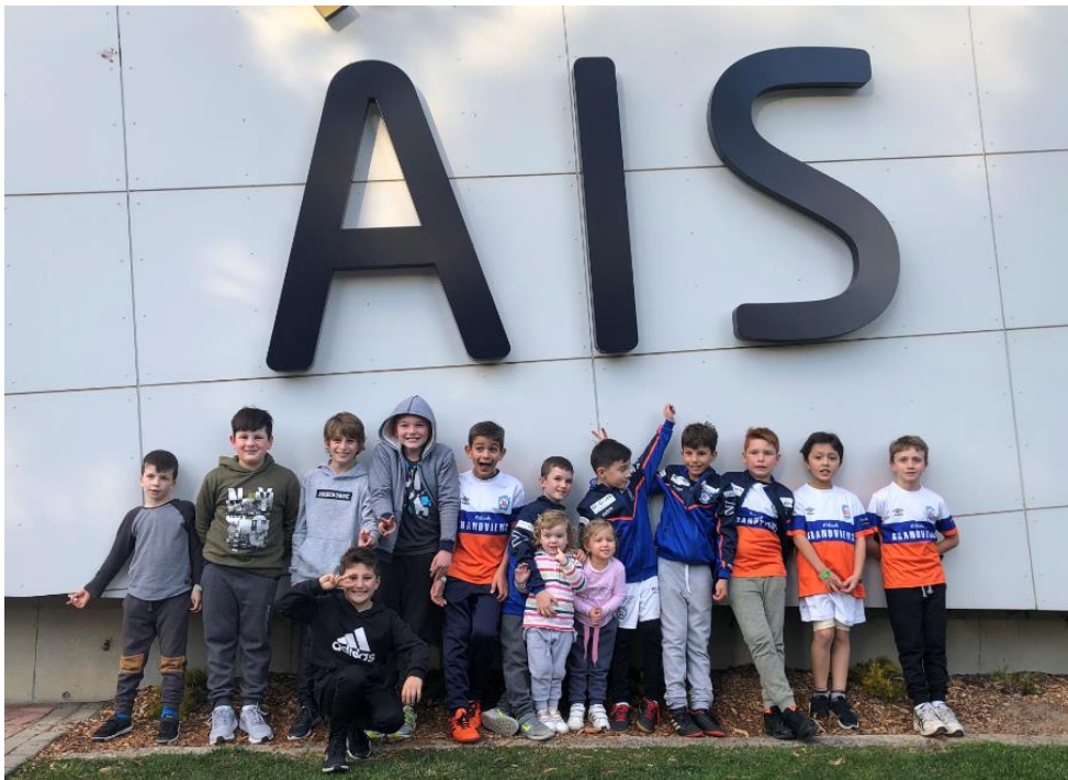
Lugarno U9s (with siblings) assemble in front of the AIS