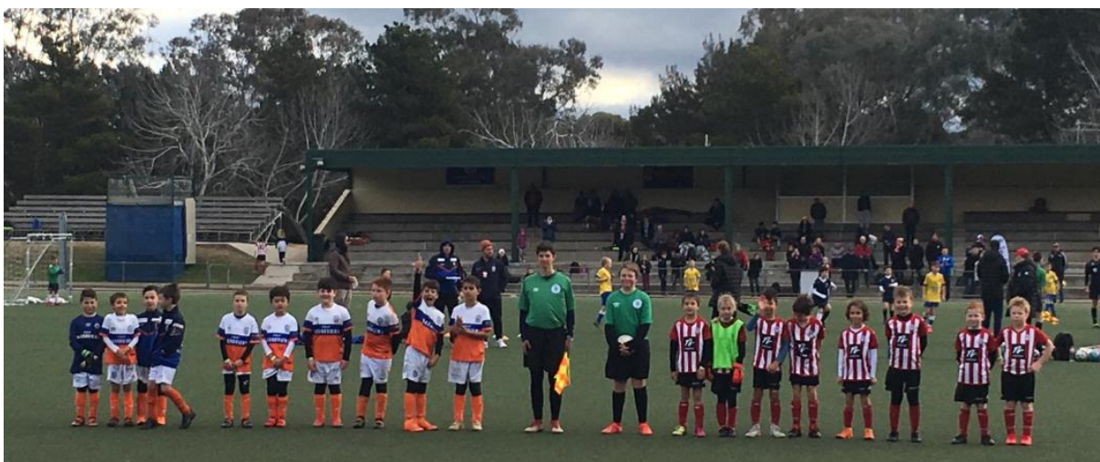
Lugarno and Northbridge players assemble pre-game. Manager and Coach watch nervously from behind.