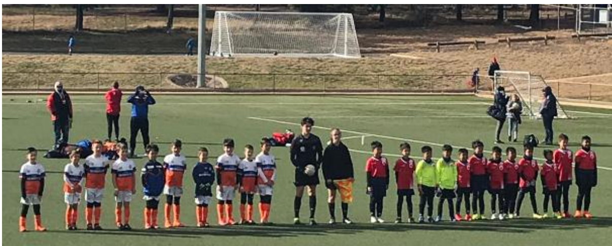
Lugarno FC v ActiveSG Football Academy (Singapore) – Quarter-final, 2019 Kanga Cup