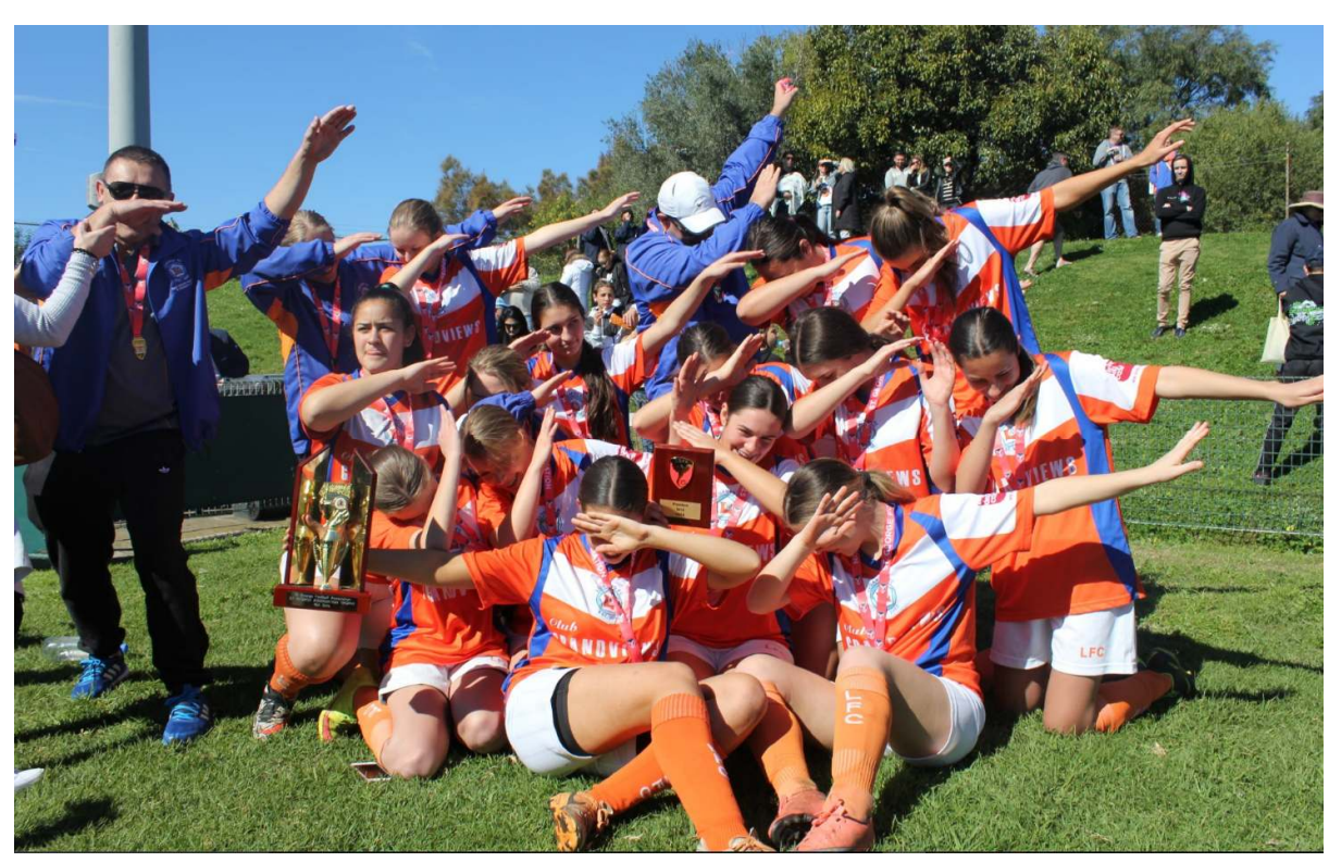
Dabbing (coach needed some help)!!

Most of all we would like to thank the girls, hopefully we'll see you all again next season and we can go for 4 in row.